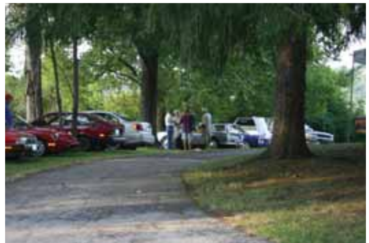
The setting: in the trees, up high on a bluff overlooking the river. This is the perfect place to relax, admire and talk about cars.