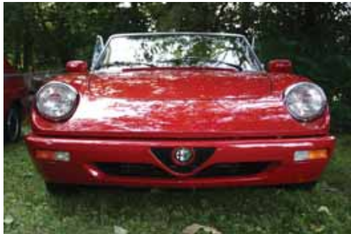
Hal Flemming's Series 4 Spider at the Fall Picnic