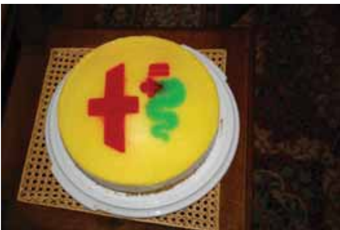
Graham Davis created a special Alfa dessert of lemon mousse.