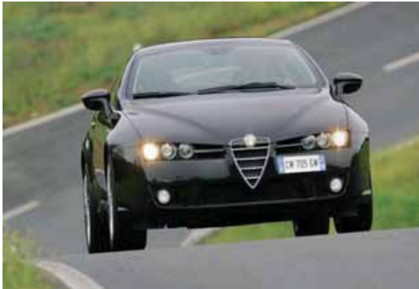
Alfa Romeo Brera

Quick backstory: Alfa Romeo, faced with a stack of complaints about quality and reliability, slumped away from the American car market in 1995 with a whimper. They have barely been missed. But then corporate parent Fiat kicked the brand into gear, reworked everything, un-